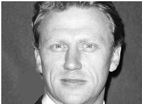
McKidd: regular on British TV

Please tell me about the actors who played Pullo and Vorenius in the series Rome ?